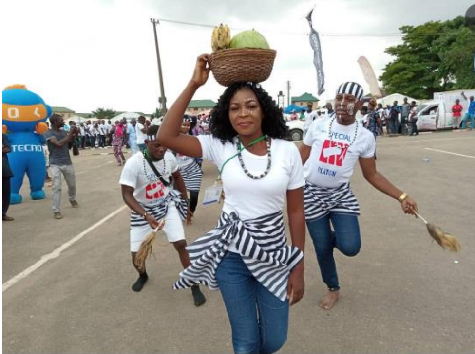
Figure 1. cultural dancers

becomes clear that a people's over- all life patterns are conditioned by the adherence to a specific order peculiar to them. These then manifests through the channels of their belief system, justice system, behavioural patterns, feelings, emotions, morality, possessions and institutions. And it further validates the claim that culture is a social inheritance that gives structure to people's lives (Orngu,2016:15).