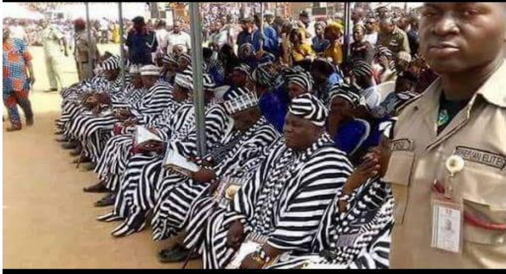
Figure 1 Tiv traditional rulers at an occasion.