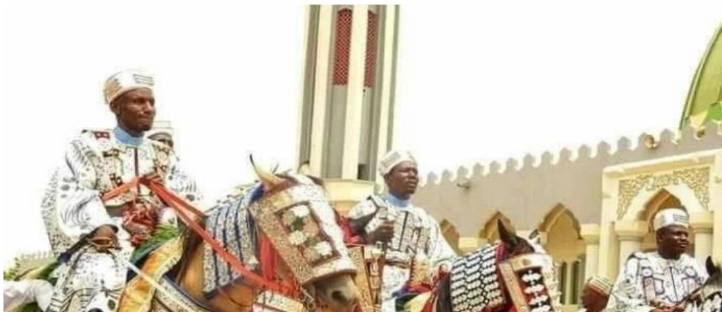
Figure 1 Kanem Bornu Horse Riders