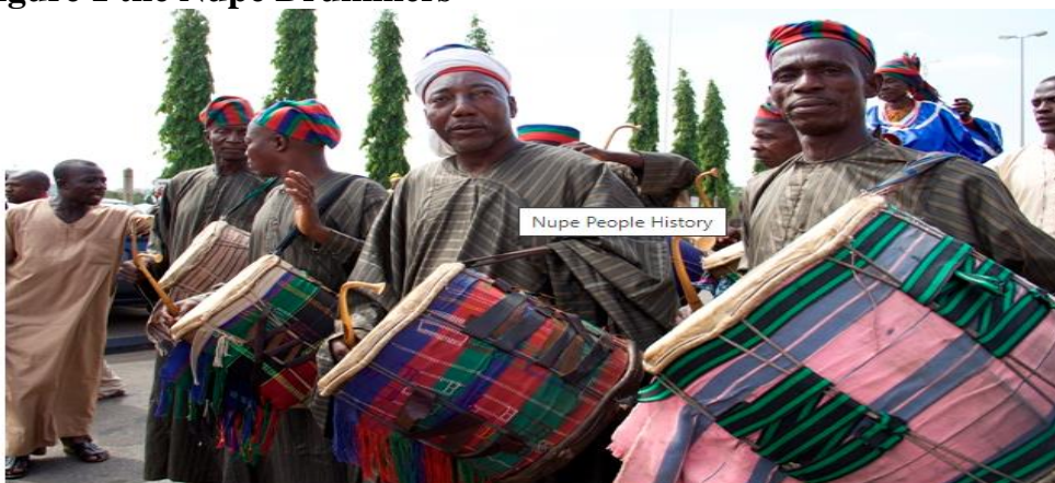
Figure 1 the Nupe Drummers

Long before the 19 th century, the Nupe people had historical links with the Hausas of Katsina, Kano and Borno people, who pioneered the establishment of some of their towns such as Abaji, Eggan, Kutigi and Enagi. In terms of culture, the Nupe borrowed substantially from their neighbours across the river Niger such as Yoruba, Igala, Gwari and Borgu. It is pertinent to state, that the Nupe did not only borrow culture from her neighbours but also donated some aspect of her culture to them. For instance, while they borrowed the kingship system of Igala land, they in turn introduced the Egugu masquerade in Yoruba land. It was also from Nupe land that Islam spread to the neighbouring Yoruba towns like Offa and Ibolu communities. By the early 19 th century, the existing political structure in Nupe land was altered due to the outbreak of the Fulani Jihad. The Nupe indigenous rulers were dislodged from their offices by Fulani Jihadists who took over their positions.