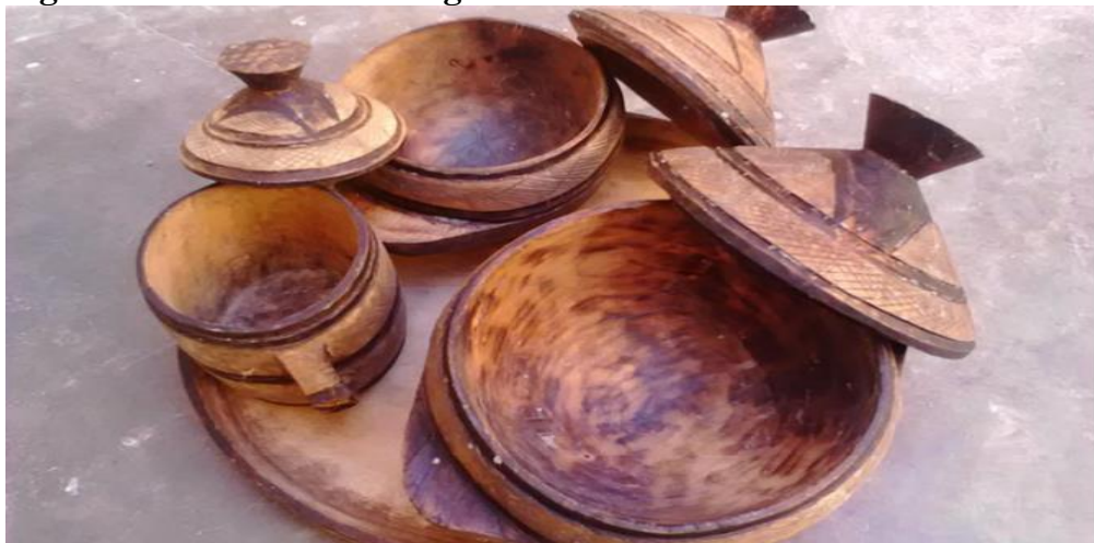
Figure 1. Traditional Eating utensils

Tradition is originated from a Latin word “Traditio” which means set of beliefs and customs of a people carried out in the past and transmitted through communication and documentations from generation to generation. In this contemporary era, some aspects of traditions of a people are being modernised based on the enlightenment that western education has brought into our societies. Sometimes too, some persons decide to do things their own ways, mostly, when they belong to a high class in the society. And if they manage to sustain such act or deed over time, there will be followership which will definitely have some amendment effect on the existing tradition. Such attitudes and values held by such personalities influences the general attitudinal behaviours and values of others coupled with their norms which are subsumed in their culture. Tradition also means beliefs or customs handed down from the past; it also means opinions, doctrines, and practices, rites passed from father to son and from ancestors to posterity either oral or written.