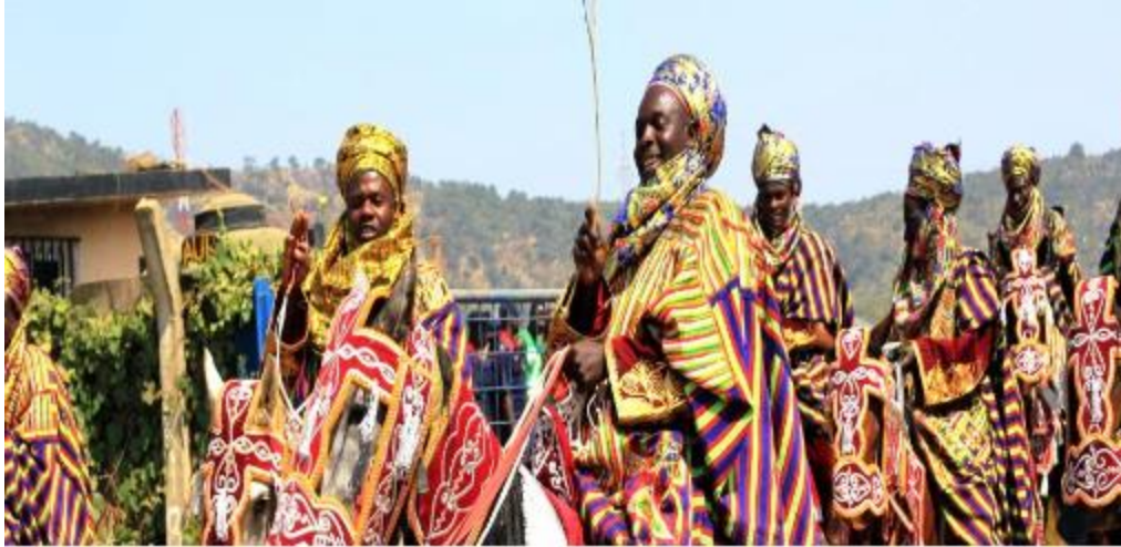
Figure 2 Hores riding for Transport and cultural celebration

militancy, administrative and ritual powers. The Oba had a council constituted by the community 's chiefs. The details of all the above will be discussed in the subsequent chapters.