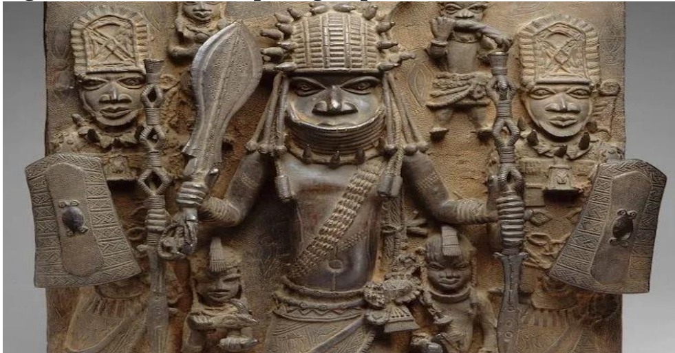
Benin bronzes depicting prehistoric Nupe warriors in those days when Benin was a Nupe kingdom.