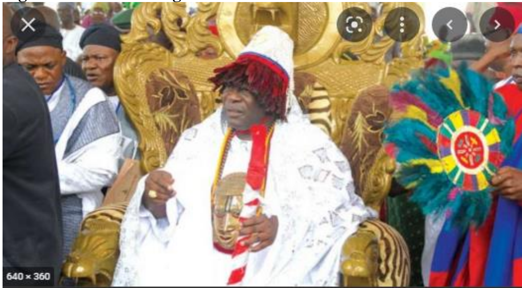
Figure 1 the Attah of Igala

In contemporary approximation, Igala kingdom at its summit in the 1830s covered the entire present day Kogi state, parts of Niger state, Nasarawa, Benue, Enugu, Anambra, Delta and Edo states. The Igala kingdom too large for any unifying central control, bedevilled by irreconcilable internal rifts, weakened by loss of the economic power, eventually fell to the canons of the British colonial empire in early 19 th century.