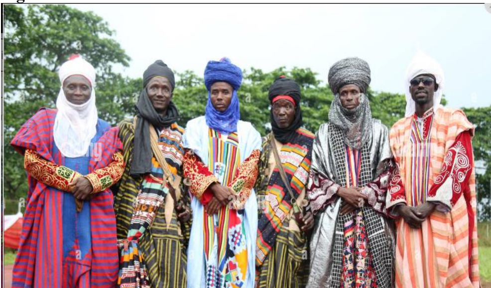
Figure 2 Hausa/Fulani Male Costumes

The Jihad dramatically altered the political equation of Hausa land as Fulani's who supported Usman Dan Fodio in his campaign took over the seat of powers across the land. Ever since, the entire Hausa land was brought under the rulership of the Fulani with Sokoto being the headquarter of the Islamic caliphate.