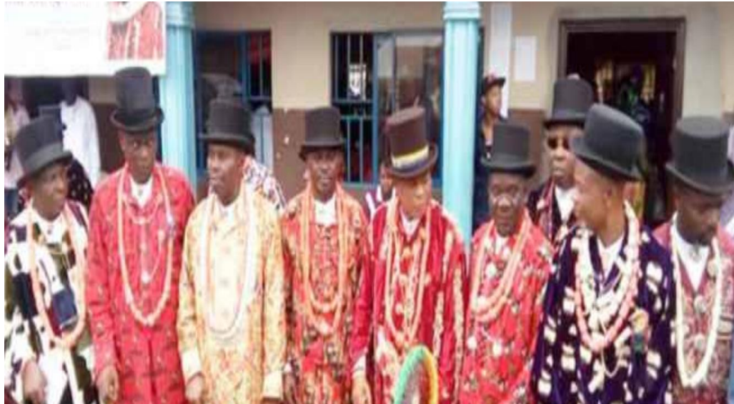
Figure1 Monarchs of Ijaw Land

Moreover, just like in Igboland, the adult male members of the Urhobo society were divided into age sets corresponding with youth, middle age and elders. Of course, each of the age sets performed specific duties in the societies.