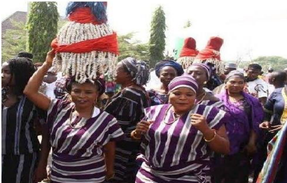
Figure 2 Cultural troupe of Ebira land