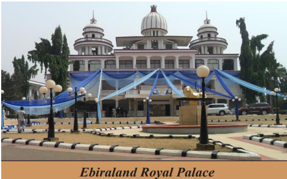
Figure 1 the Palace of The Royal Father of Ebiraland

According to Okene, (2000) Greenberg's classification of African languages, Ebira belongs to the Kwa group of the Niger-Congo family, which also comprises the Nupe, Gbari and Gade (Greenberg, 1966). Recent in-depth research indicates that the Ebira have been part and parcel of what is now generally known as Central Nigeria since 4000 BC (Ohiare 1988). Thus, Ebira history is tied to that of their neighbors,