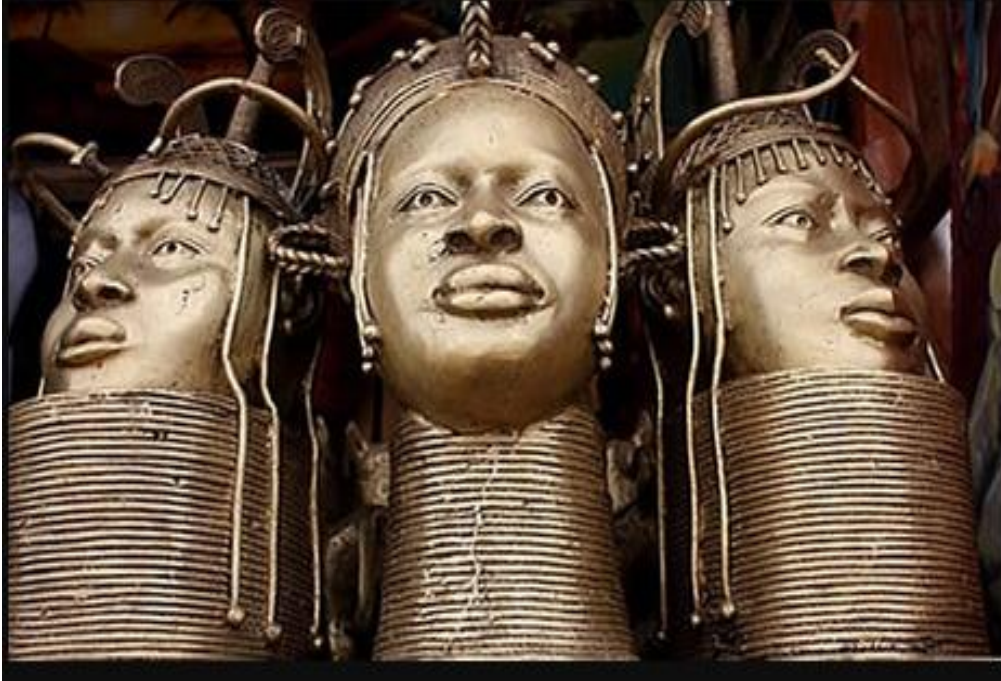
Figure 2. Bronze arts Work of the Bini Kingdom