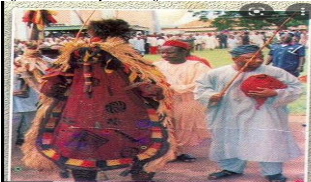
Figure 2 Masks Masquerade of Igala Land