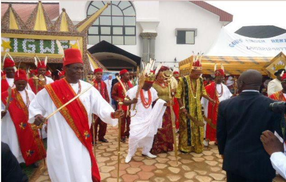
Figure 2. Some Igbo Monarchs after a Meeting