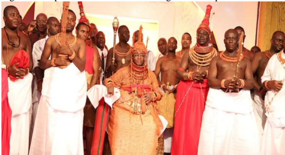
Figure 1. the paramount ruler of Bini Kingdom at his palace

The government of the conquered states was generally left in the hands of the local kings. They left their own laws and observed their own traditions. Occasionally officials were sent round to see that royal edicts were followed. But as long as the local rulers kept the peace within the empire and contributed their tributes, the Oba of Benin left them undisturbed. It was only where local rulers showed signs of disloyalty and rebellion that the Oba of Benin found it necessary to impose a ruler and provide a garrison to enforce the people's loyalty. This happened, for example, in the island of Lagos in the time of Orhogbua, in the second half of the sixteenth century.