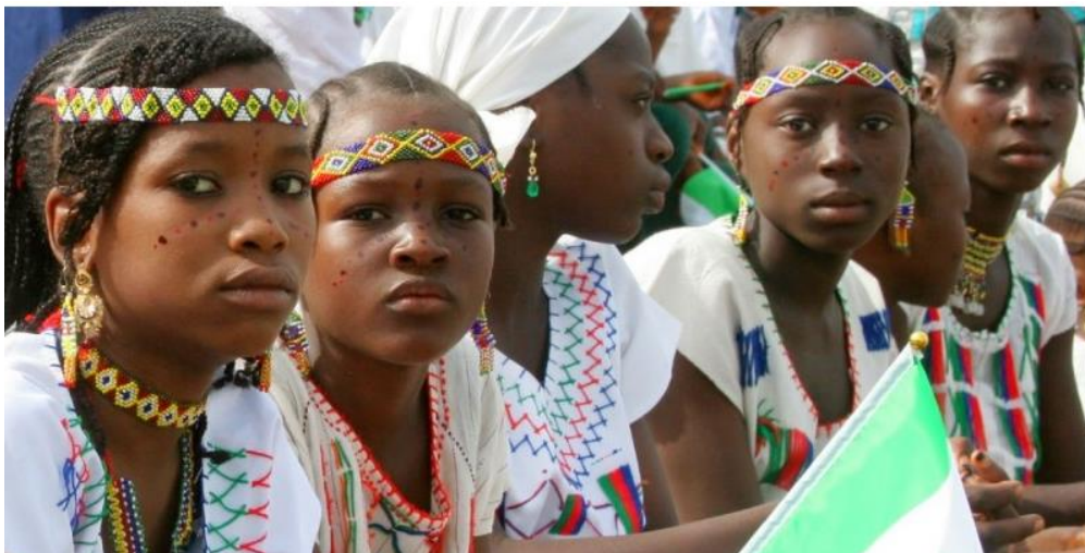
Figure 1 Cultural dressed Fulani celebrating Nigeria Independence

He first stayed at Biram-ta-Gabas, where his wife bore him a son. He left his family there and came to Daura, where he was said to have performed a great feat, killing a sacred snake, "Sarki" which had for years deprived the people of water from a well, except on Fridays. In appreciation of this deed, the Queen of Daura married Bayajidda. Out of this union was born a son called Bawo. Later this Bawo-magari had seven children, who became the founders of the original Hausa states, called Hausa Bakwai.