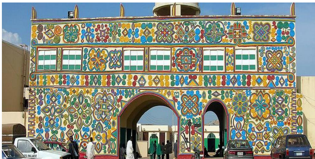
Figure 5 The Palace Gate of the Emir of Zazzau