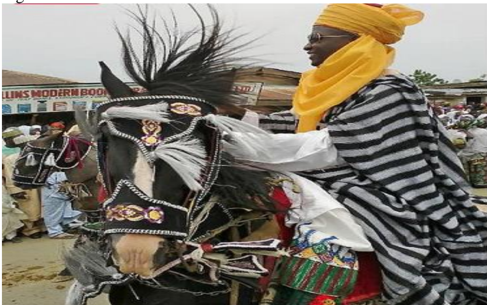
Figure 2. Decorated Horse and the rider

Thus, administration is seen as a process of management which is practiced by all kinds of organisations from the household, family and