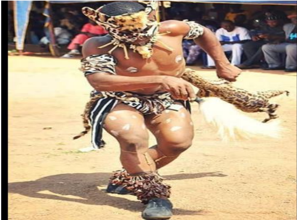
Figure 2 Tiv Traditional dancer

Thus, Ipusu and Ichongo have since expanded into a large tribal nation, occupying 14 Local Government Areas in Benue State. More so, as stated earlier, the Tiv sons and daughters are also found in large numbers in other States such as Taraba, Nasarawa, Plateau, Cross River and the Federal Capital Territory (F.C.T) Abuja, with others living in Cameroon Republic.